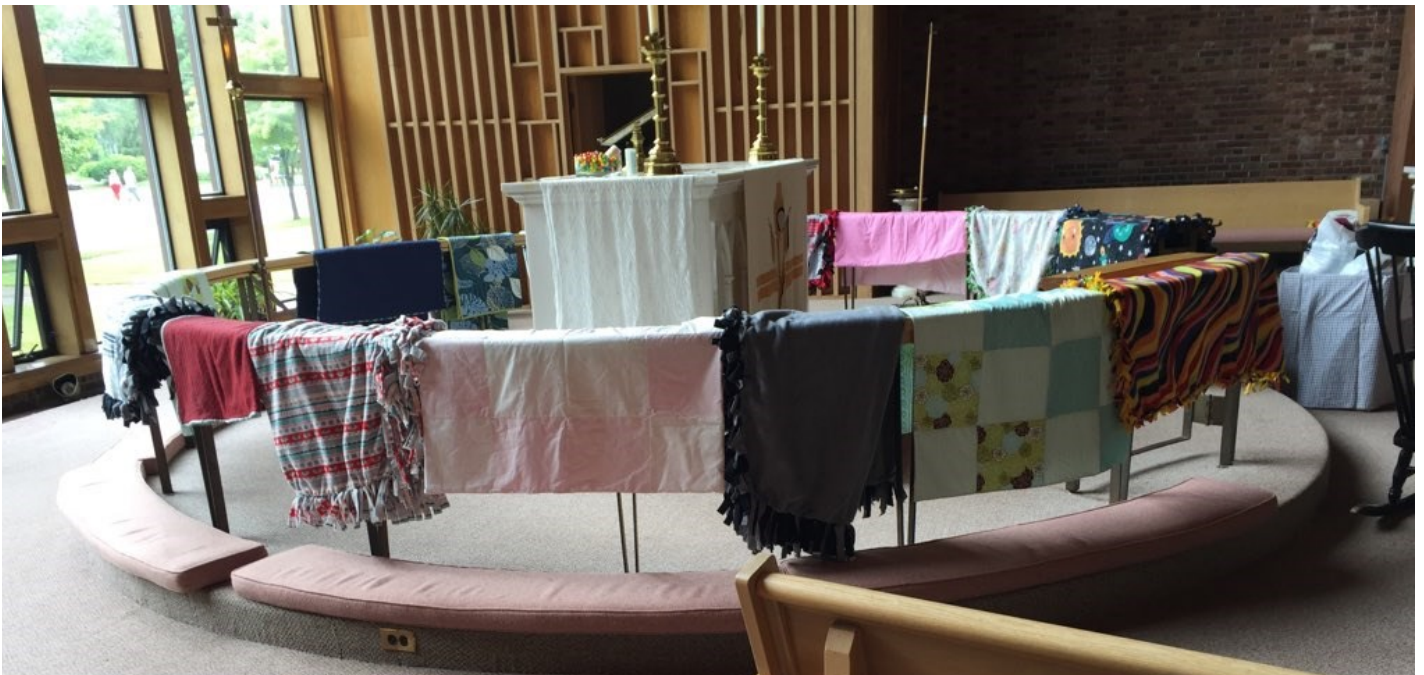
Some of the blankets from our Lap Robe project for Lutheran Homes